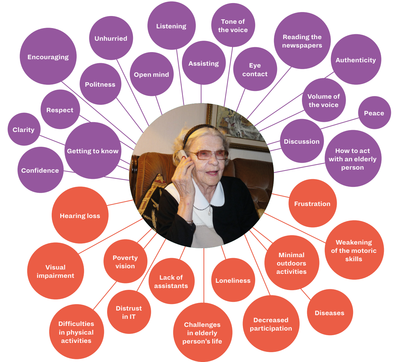
FIGURE 1. Different aspects of the everyday lives and encounters with older people.

The befriending activities have helped enhance students' understanding of the everyday lives of older and disabled people, their functional ability and coping, and more broadly of the challenges related to an ageing population, which are also apparent in the social and health care service system. It is hoped that an increasing number of older people will be able to live independently as long as possible, and therefore students should be