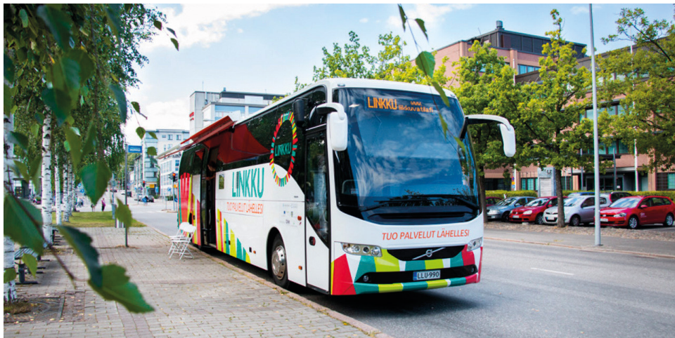
FIGURE 1. Kuvateksti

This article describes the opportunities offered by the Linkku SmartBus project in responding to challenges related to well-being in older people in the Päijät-Häme region.