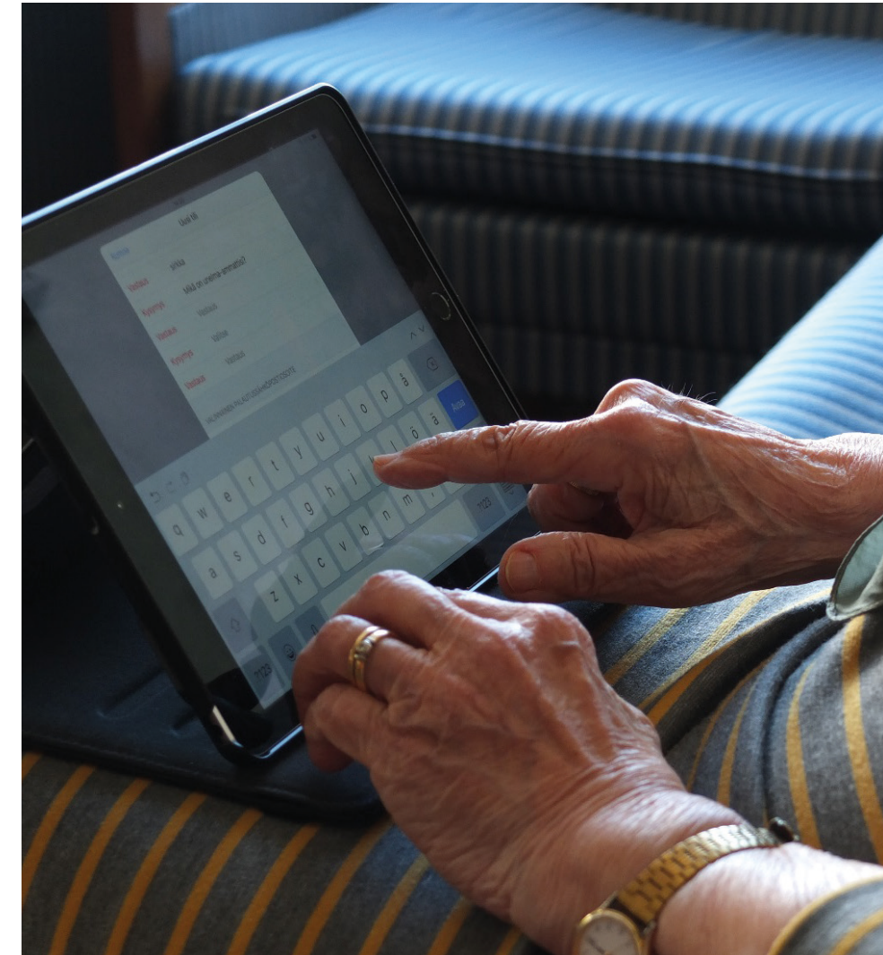
Figure 1. The daily journal material encouraged older people to document their everyday interactions as a basis for social online service solutions.

The word-of-mouth market extends beyond social media and new digital networking solutions. Older people in particular listen to and follow their peers when making decisions. In some development cases, the inclusion of a user group can enhance the adoption and spread of a new service and kickstart peer-to-peer marketing. In senior solutions in particular, the opportunities of peer groups are an interesting addition to solutions. In a time of