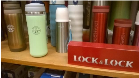
Image 1. A selection of thermos bottles of Lock & Lock brand

for hours. It is worth noting that a large variety of thermos bottles were targeted to children with cartoon designs and bright colours. A basic thermos of Lock & Lock cost IDR 360 000, EUR 24, which indicates that prices for imported products can be rather high.