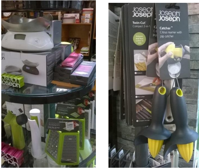
Image 5-6. Products of Joseph Joseph in Sogo

When it comes to serving food or drinks, either of the two big stores observed presented anything similar to the dishes of Magisso. Products that were marketed to keep drinks cool were typically in the form of thermos bottles of all sizes and styles that were pointed out in the previous chapter. However, they serve a different purpose, carrying drinks around which is the opposite of Magisso's Cool Ceramics tumblers for example aim at serving food or drinks on spot.