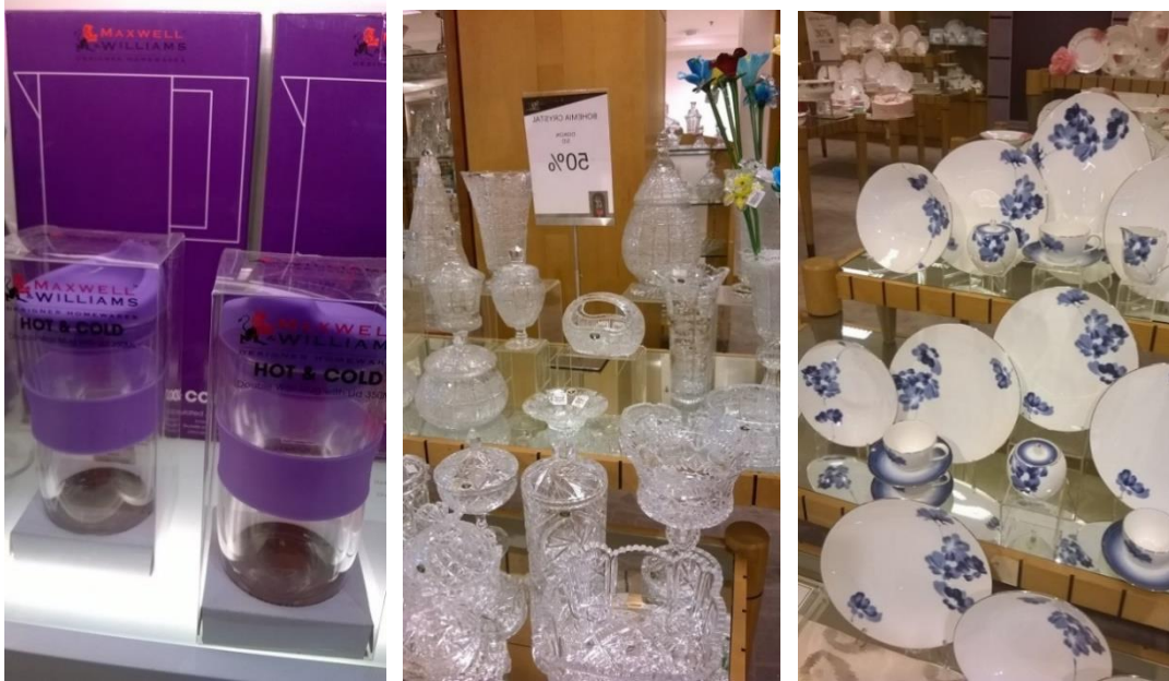
Image 2-4. Examples of products in Metro and Sogo

When it comes to kitchen tools the stand of Joseph Joseph drew attention in Sogo. The products of this brand had a separate corner at the home decoration department with wooden shelves and a more attractive presentation. Simple tools to squeeze juice from a fruit (price IDR 160 000, EUR 12), remove chopped vegetables from a folding cutting board, bottle pourer spouts and foldable graters were part of the selection. Sogo's brands for kitchen tools included also the brand Monkey Business, originally from Israel (Monkey Business 2015). Monkey Business offered small kitchen accessories such as lid lids that simplify cooking. It is their funny design, small colourful men that distinguished them from other products with similar functionality.