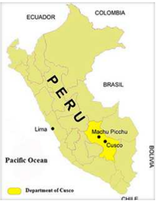
Picture 2. Location of the province and city of Cusco. (Google 2016)

Major and most known nearby tourist sites are Inca emperor, Pachacuti's presumed winter home, Machu Picchu, and the 'fortress' at Ollantaytambo. Although the original Inca city was said to have been founded in the 11th century, more recently scholars have established that Inca did not occupy the area until after 1200 AD. Before them the indigenous people of the Killke culture built the walled complex of Saksaywaman about year 1100, a major temple near it, as well as an aqueduct (Pukyus) and roadway connecting prehistoric structures. Saksaywaman was expanded by the Inca. (UNESCO 2016; Wikipedia 2015a.)