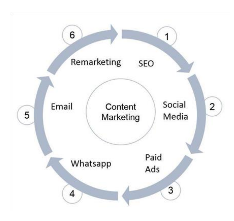
Figure 1- Content Marketing process

The main focus in Content Marketing is to be found by the person who might be interested in your product or service instead of finding and seeking for possible customers yourself. It is called content marketing because it's all about providing relevant and helpful content related to the provided service or product (Halligan 2013, 5.) It can be seen as an umbrella term for many marketing channels which will lead to attention and organic/ earned traffic. The trend of content Marketing started when Google changed its algorithm for their search results which detects and removes low-quality content and spam and changed the focus on promoting brands with high quality web content (Rand Fishkin and Thomas Høgen-haven, 1-4 2013.) Below is an approach for Motivade's marketing which contains a mixture of content Marketing and paid advertising.