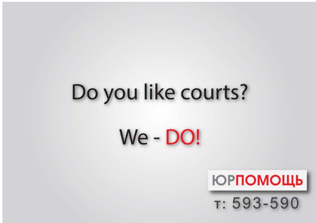
Picture 3. Final advertising poster for law company in English language.