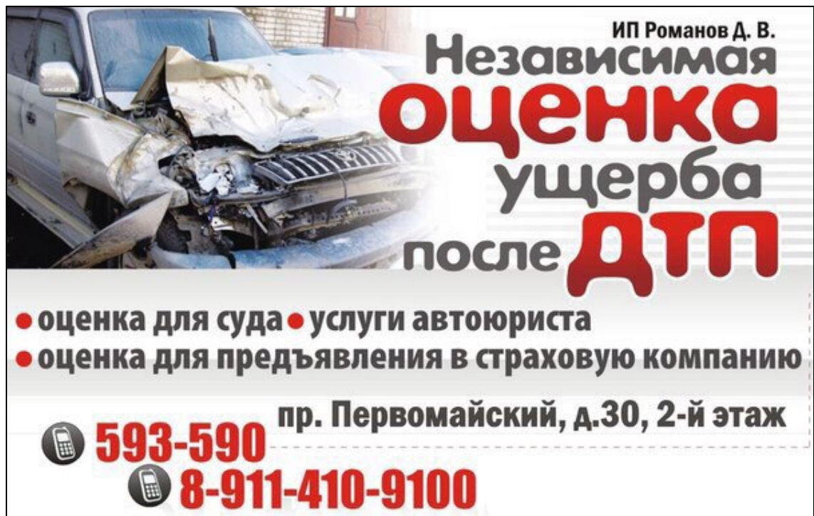
Picture 1. Previous client's advertising poster.

From the beginning of their work they had only one advertising poster (Picture 1).