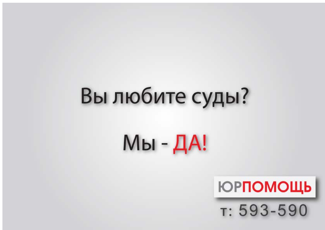
Picture 2. Final advertising poster for law company in Russian language.

The final version my client decided to choose was this (Picture 2 in Russian language and Picture 3 in English language):