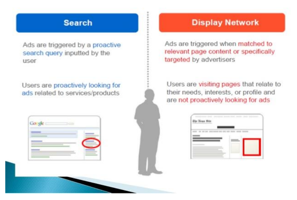
Figure 4, The difference between the two networks where ads run. Picture from Google Images.

Ads can run on two different networks, in Google Search Network (GSN) and in Google Display Network (GDN). In a GSN, an ad is displayed directly in the search results on topor on the right side of the page and in GDN, ads can run within a wide variety of websites (Adwords Help 2016.) The website that I visited as a test was a part of GDN and one of over 2 million other sites that reach over 90% of global internet users (Adwords Help 2016.) It is recommended that ads run on GDN when companies offer products and services that users would not usually buy on their first visit to the website. Remarketing on GDN improves brand visibility and so when users finally make a decision to purchase, the remarketed company brand stays on-top-of-mind of the consumer (Adwords Help 2016).