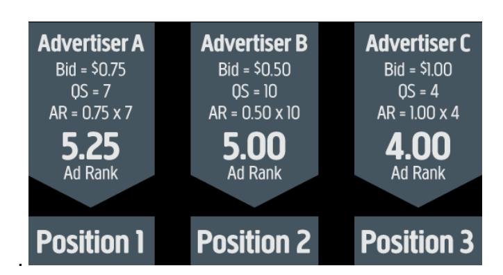
Figure 7, Calculating AdRank.

The name and data of figure 6 has been changed but it gives an idea of what a SEM-report looks like and how key figures are presented. Figures are (normally) provided by Google Adwords. To determine if an ad has performed well in terms of conversions and landing page quality, it is important to know what the KPI's mean for the campaign and how the facts are calculated in figure 6.