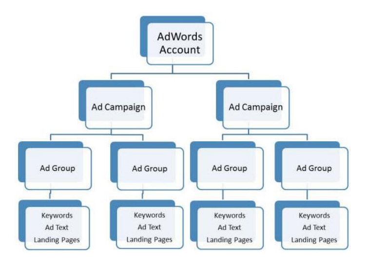
Figure 5, Structure of an ad campaign maintained by Google Adwords.

I also continued refreshing ads for another company website, renewing an entire ad campaign. For example as a reference (not actual case), a company that sells clothes online can launch an ad campaign where the company advertises their different clothing products through ad groups.