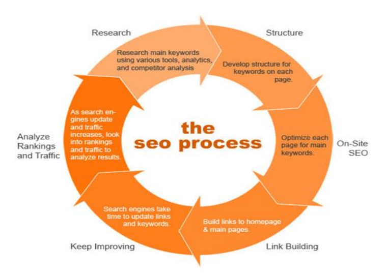
Figure 2, SEO process.

Besides being informative, good content needs to be creative and original. Developing a specific list of keywords associated with the content is important for SEO (Search Engine Opitimization). Figure 2 below illustrates this well.