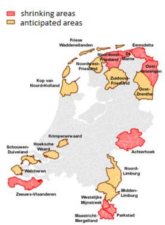
Figure 1. Decreasing number of children in the Netherlands.

The long-term vision for the educational sector includes the integration of kindergartens and elementary schools. For this to happen, new facilities are most certainly to be built or current buildings expanded. New buildings need to be furnished. Considering the demand to compete in quality, premium furniture companies have a slight edge. Moreover, future the government's impact on kindergartens' and schools is yet an unknown factor. This could lead to development in the demand of kindergartens and provide for new investments. (Rabobank 2016.)