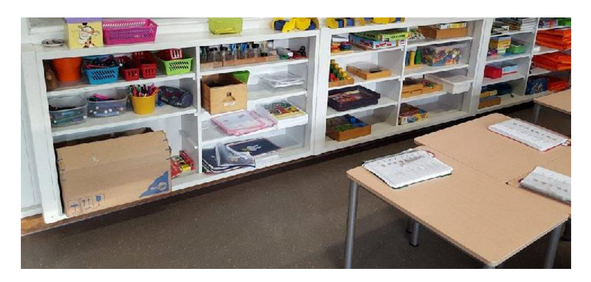
Picture 10. Furniture of a room for groups 1-2 in De Zwaluw (Source: Teacher 2016).