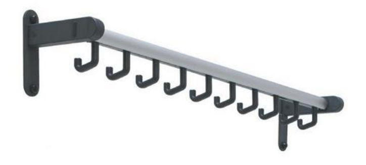
Picture 2. Stripkapstok Tertio HA (wall rack) (Source: B.C.I. 2016).