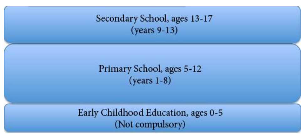
Figure 2. The Netherlands education system under 18 years old.

At the age of five, mandatory elementary school starts and lasts eight years. Although the official starting age is five, roughly 98% of the Dutch children attend the primary school already at the age of four (van Leeuwen, Thijs & Zandbergen 2009).