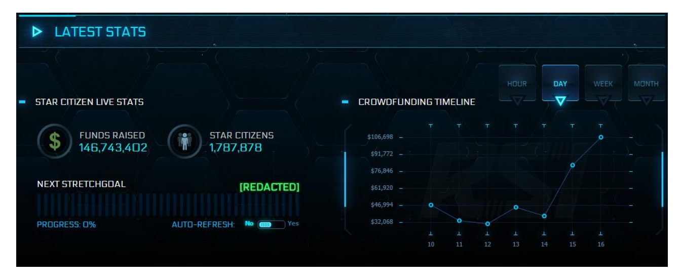
Figure 3 – Screenshot of Roberts Space Industries website (https://robertsspaceindustries.com/funding-goals), accessed 17 Apr. 2017