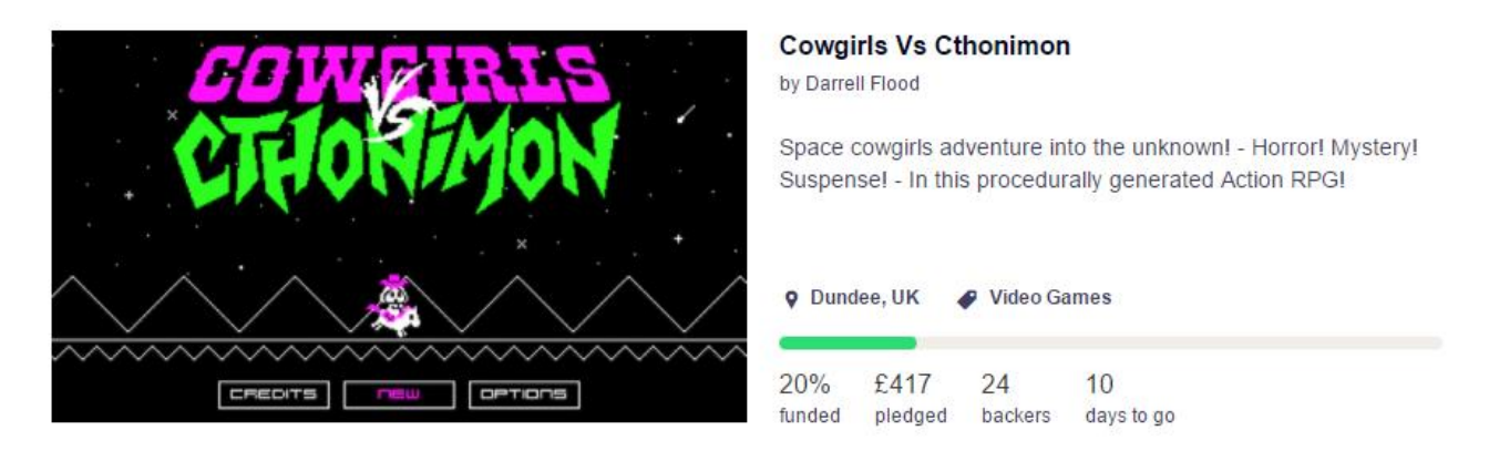
Figure 4 – Screenshot of Kickstarter feature (https://www.kickstarter.com), accessed 17 Apr. 2017

She felt that without actively campaigning herself, the project would have failed.