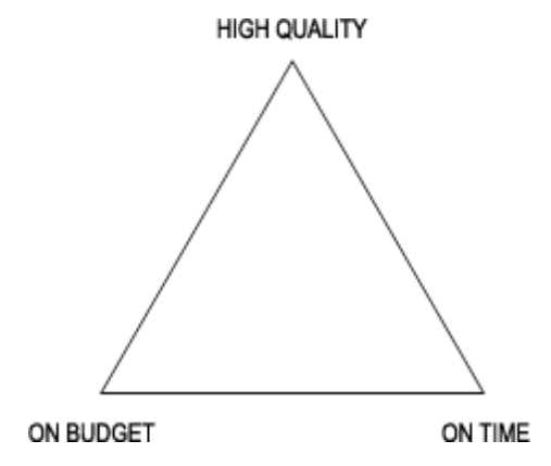
Figure 1 - The Project Triangle (Bethke 2002)

The Project Triangle, presented in Game development and production book by Erik Bethke (2002: 65-67) can be used to clarify the situation of Iron Sight. The points of the triangle signify project goals and are labeled as (1) on budget, (2) on time, and (3) high quality/feature rich. Additionally, the sides of the triangle signify relationships between the goals.