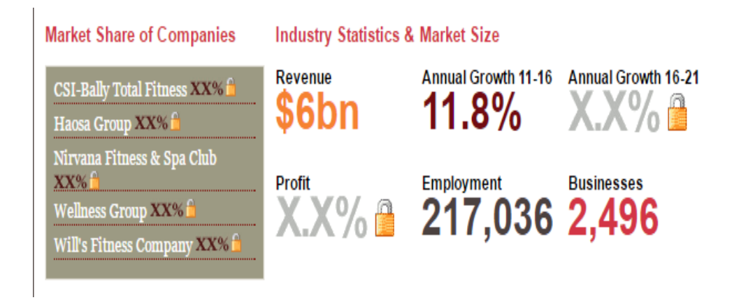
FIGURE 2. Industry Statistics & Market Size [6]

Meanwhile, because of the health awareness and fortune accumulation in recent years. There is a rapid development of the Gym, Health and Fitness Clubs industry in China. According to the Figure 2, the business of whole industry was up to 6 billion US dollars in 2016, with annualized growth of 11.8% from the year 2011 to 2016.