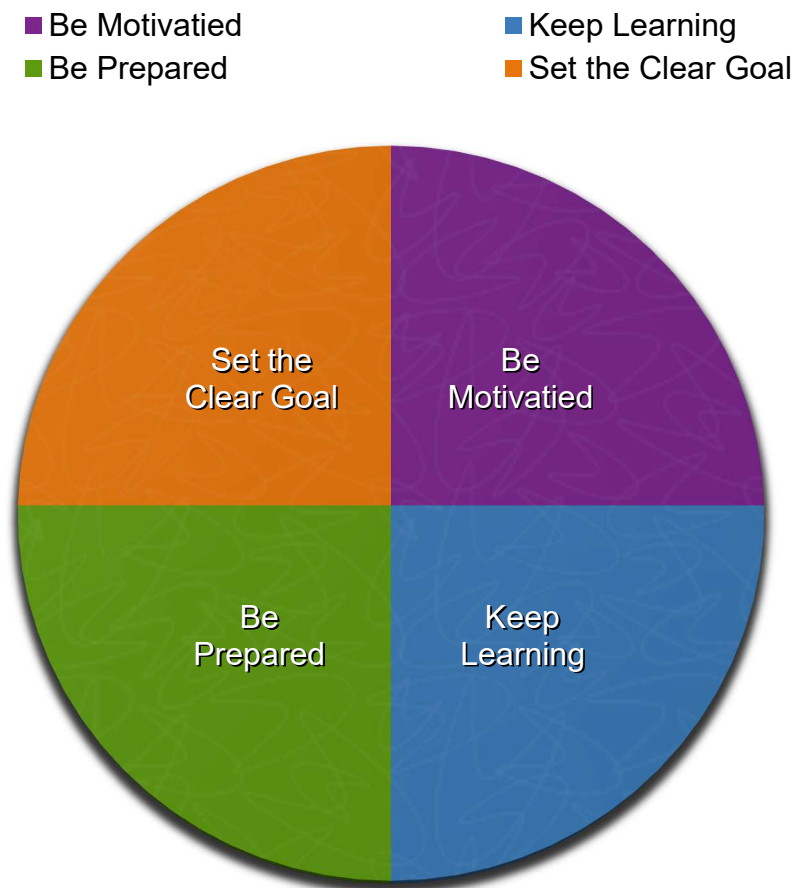
Table 7. Suggestions for future entrepreneurs