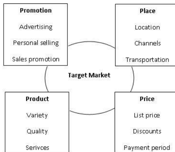
Figure 3: The four P's of the marketing mix (Kotler 2004: 58)

The marketing mix is one of the major concepts in modern marketing and is often brought up in general discussions of marketing. Marketing mix is a set of marketing tools that a company uses to pursue its marketing objectives in the target market. When a company is making decisions on marketing they generally fall into four controllable categories known as the 4 P's: product, price, place and promotion.