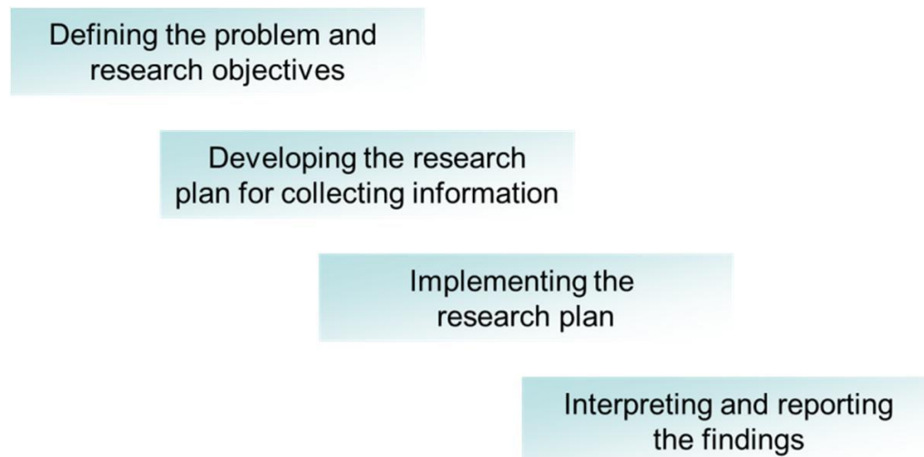
Figure 2. The market research process.

The marketing research process comprises four steps: defining the problem and research objectives, making the research plan, implementing the research plan, and interpreting and reporting the findings (Kotler 2008).