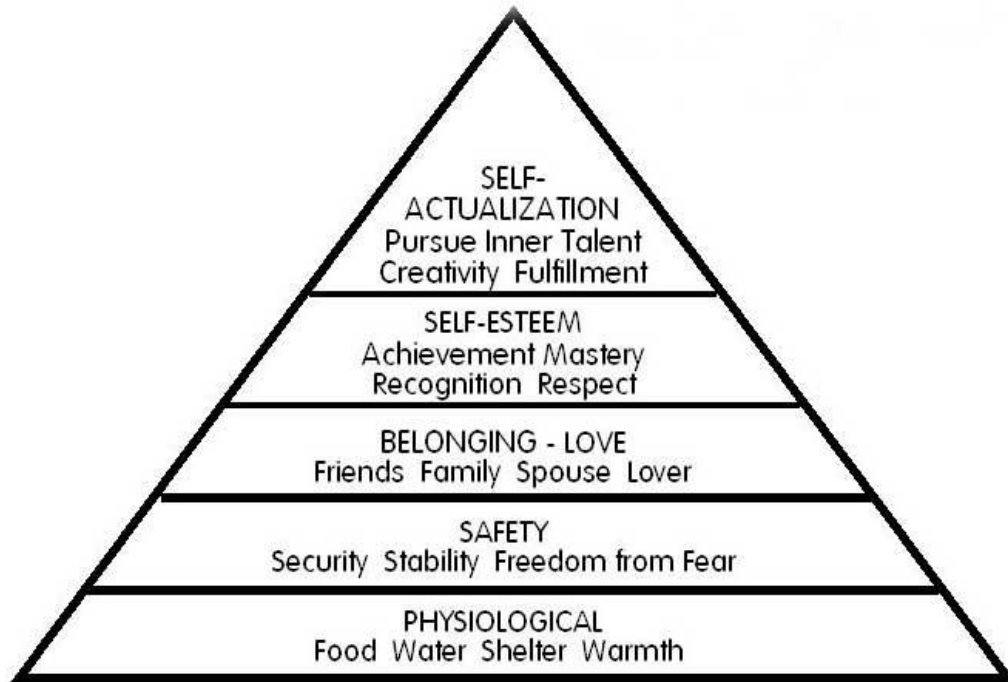
Figure 2. Maslow's hierarchy of needs