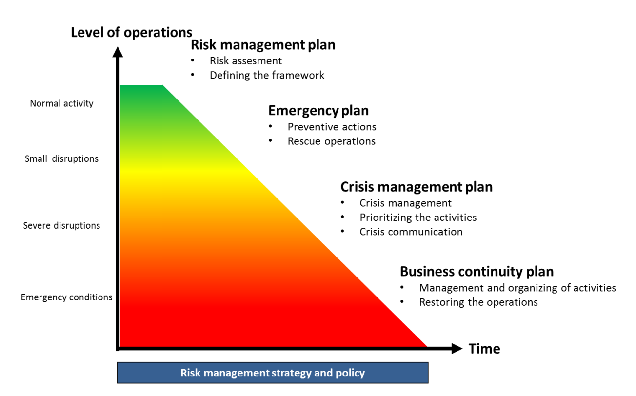
Figure 1 Risk and security management system (created during the project)

(Niemelä, Pirker, Westerlund 2008, 117-119)