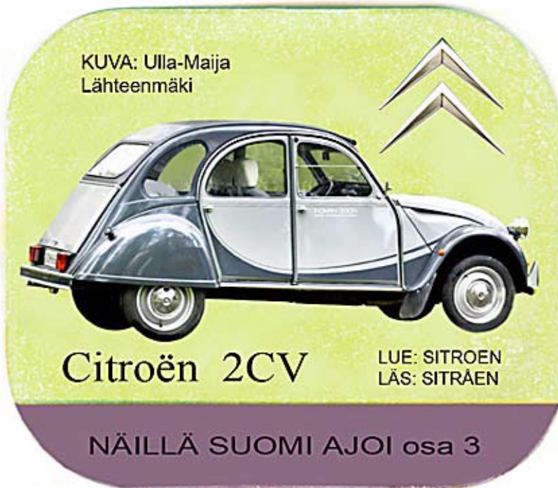
Figure 2. The 2CV (Helsingin Sanomat 2008).

Consciousness of kind appears when a group of people feel a collective similarity to one another in the group, and at the same time they feel that the group differs from other groups (O'Guinn & Muniz 2005). Another classic brand community is the Citroen 2CV Club. This club appears in Finland, as well as in most European countries. What is interesting about the club is that the product is no longer available on the market but the club and the community still exists. Quite a few of the current or previous members are still, however, faithful to the brand Citroen. Although they do not have a 2CV anymore, they still drive a Citroen, albeit another model.