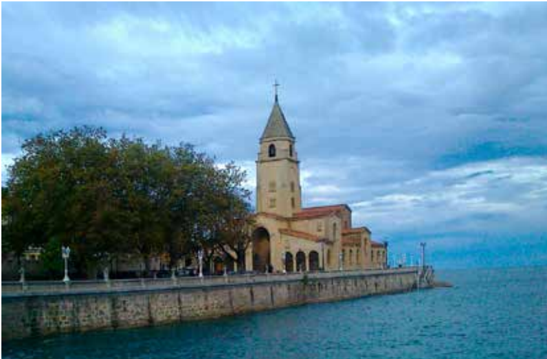
Picture 4. Asturias, Spain

In RECO project three of the best practices from other partners have been utilized in Hämeenlinna. The goal of transferring the best practices is to copy the good ideas but taking into account the cultural differences between different areas.