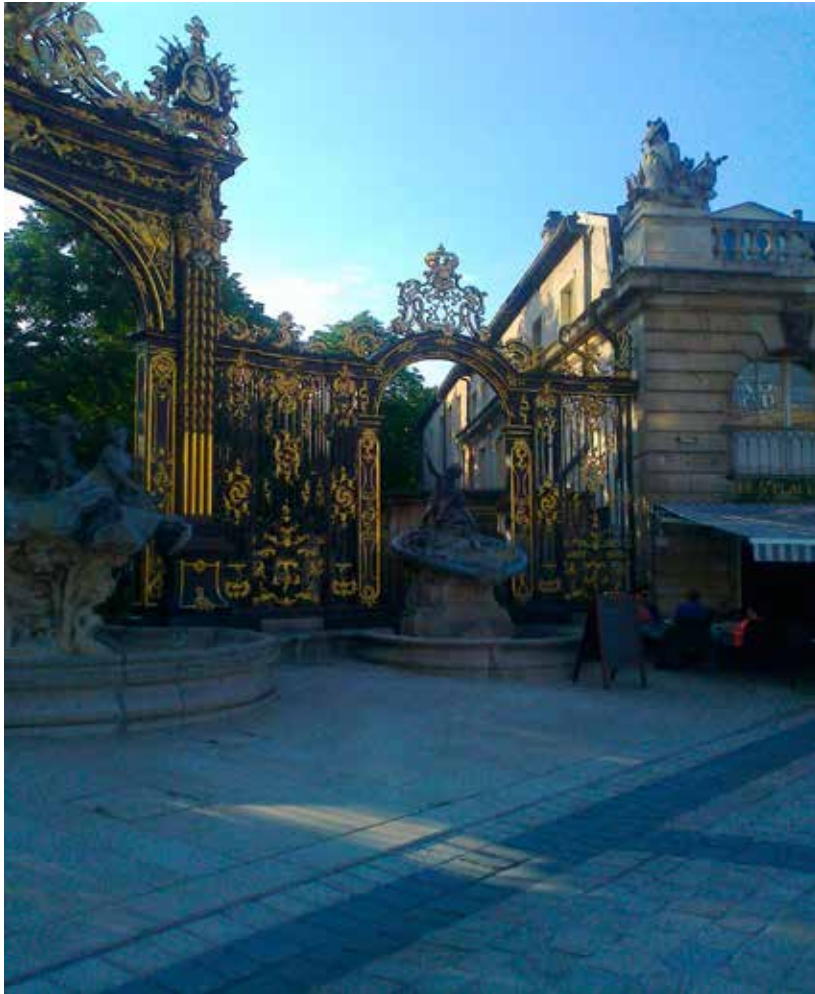
Picture 5. Stanislaw plats in Nancy, France

In Häme region development of voluntary work as part of promotion of elderly well-being and service system became more visible.