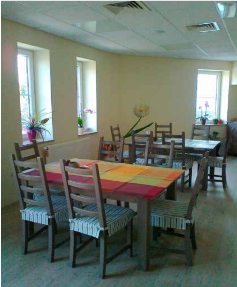
Picture 1. Elderly home in Poland

RECO project searched through enhanced cooperation between public authorities, universities and volunteer associations best practices regarding the service to elderly people. The cooperating regions exchanged ideas and experiences through study visits and workshops in every region. (Information about Creator mini-programme 2011)