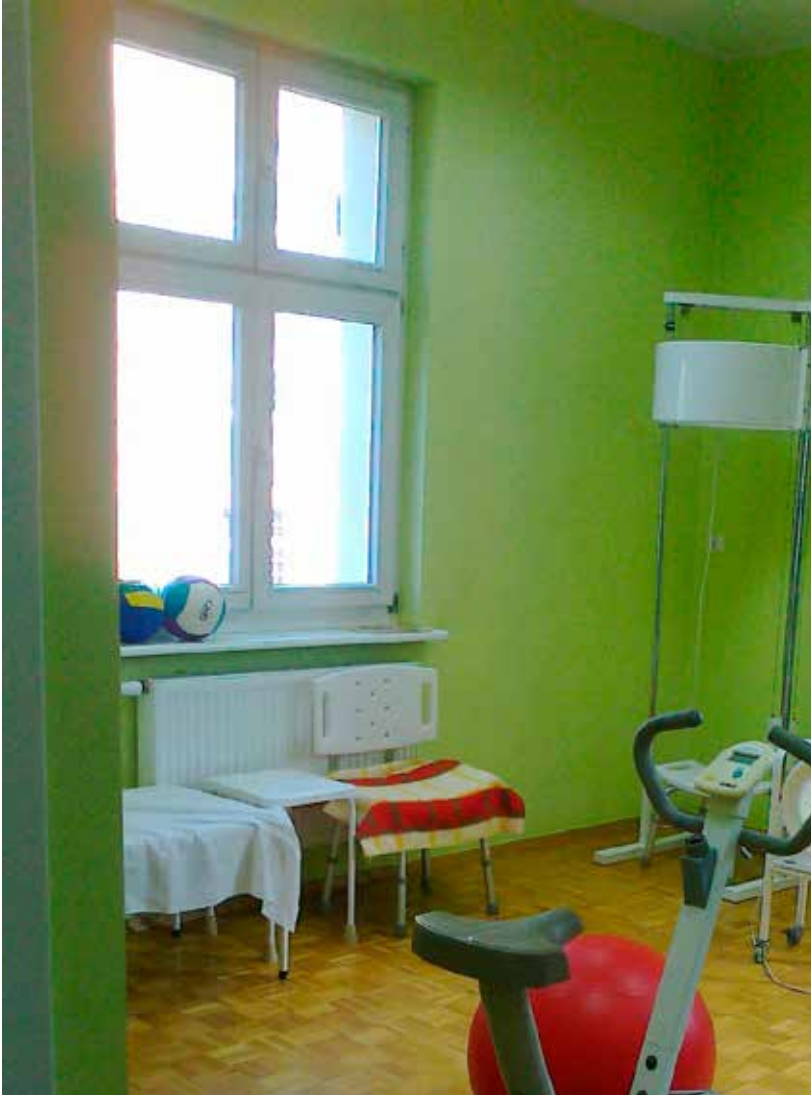
Picture 2. Activity center for elderly in Poland

In the conference there were presentations and meetings about elderly care in Europe and about the best practices in different countries. In the conference meetings the very best practices of all were selected and defined.