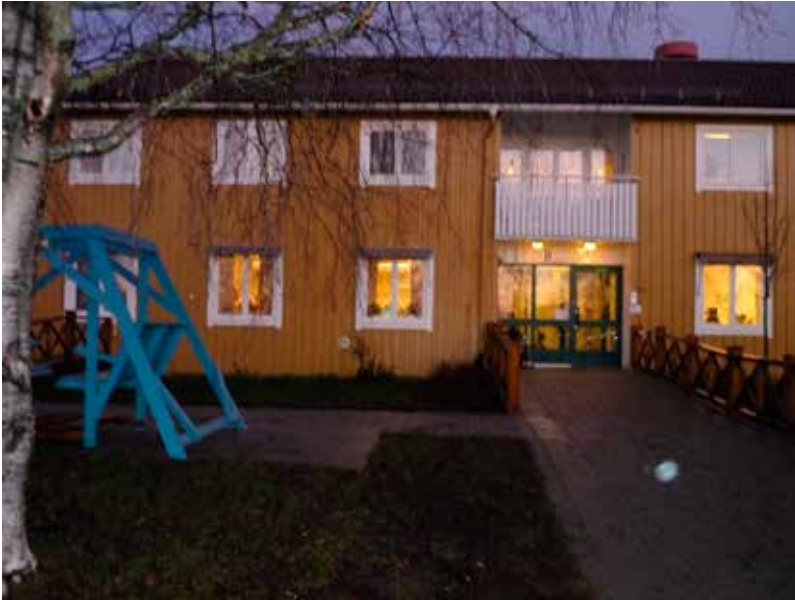
Picture 3. Elderly home in Umeå, Sweden

the events. Normally there have been 5 to 25 people present in the events. The most popular event was Christmas carol session in December.