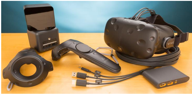
Figure 2. HTC Vive (Greenwald 2017b).