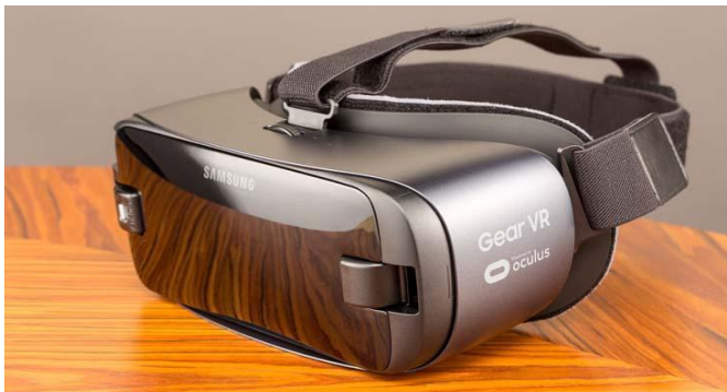
Figure 1. Samsung Gear (Greenwald 2017b).

The headset itself comes with a motion controller, which is a great add-on. There is, however, not many software, which support the motion controller. The potential is huge, however - as Facebook, Oculus and Samsung are continuously working on adding more possibilities for the controller. (Greenwald 2017.)