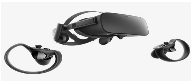
Figure 3. Oculus Rift (Hyde 2017).

The Rift is mainly known for its good design, more affordable price than its competitors, the low minimum PC requirements and a huge and continuously growing list of games, movies and applications. As shown in Figure 3 Oculus Rift headset comes with a pair of touch controllers. (Pino 2017.)