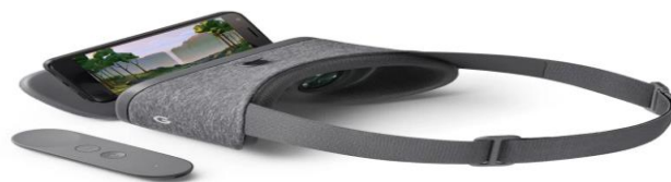
Figure 6. Google daydream view (Arici 2016).

Unlike Samsung Gear, which is built out of solid plastic, Google daydream view, as shown in Figure 6, is made out of soft fabric that forms accordingly with the viewer's facial features.