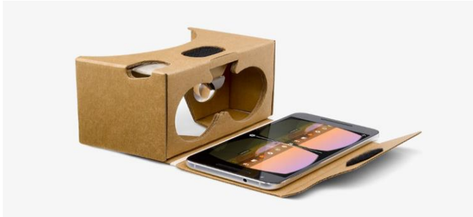
Figure 5. Google cardboard (Google 2017).

Cardboards are completely acceptable for shorter virtual reality sessions of gaming, or viewing videos.