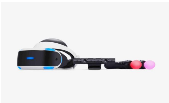
Figure 4. Sony PlayStation VR (Co 2017).

Unlike HTC Vive and Oculus Rift, PlayStation VR is purely meant for gaming and does not require a PC, it does however require the PlayStation 4 and a PlayStation camera which are not included in the purchase of the headset. According to several reviews, the picture is rather blurry. On one hand the resolution is lower than its competitors' ones, but on the other hand – it is also the cheapest of all the tethered headsets. Sony PlayStation Move Motion controllers, shown in Figure 4 have to be bought separately however. (Thang 2017.)