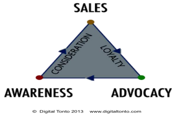
Figure 2. Process of clarifying business objectives.

2. Use Innovation Teams to Identify, Evaluate and Activate Emerging Opportunities – this means that another vitally important part of doing business nowadays is seeking for companies, which can be helpful for you and have a good potential of future collaboration. For example in food ingredients business it can be merged seminars with confectionary or dairy producers organized by this producers or European suppliers. That kind of seminars can be a good advertising platform. (Setell 2013.)