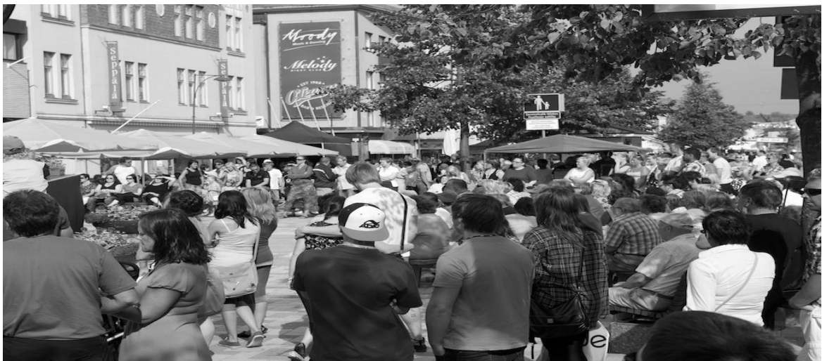
GRAPH 7. Jakobs Dagar in Jakobstad

Jacob's day's festival has been organized since the 1970's, and with time has expanded from one weekend to a whole week of public festivals where people meet each other and reunite. During this whole week, the town is full of different forms of events and happenings for both the young and the old all over the streets and lanes. The climax of the festival is usually on Saturday at the Old- Times Fair, when the market place is full of salesmen and women dressed up in quaint old-fashioned clothes, and there is a non-stop programme in the town centre all day long. In the evenings, the town is filled with music from the market place, cafes and restaurants along the pedestrian precinct, and the outdoor stage in the school park. (Jylhä 2008, 8.)