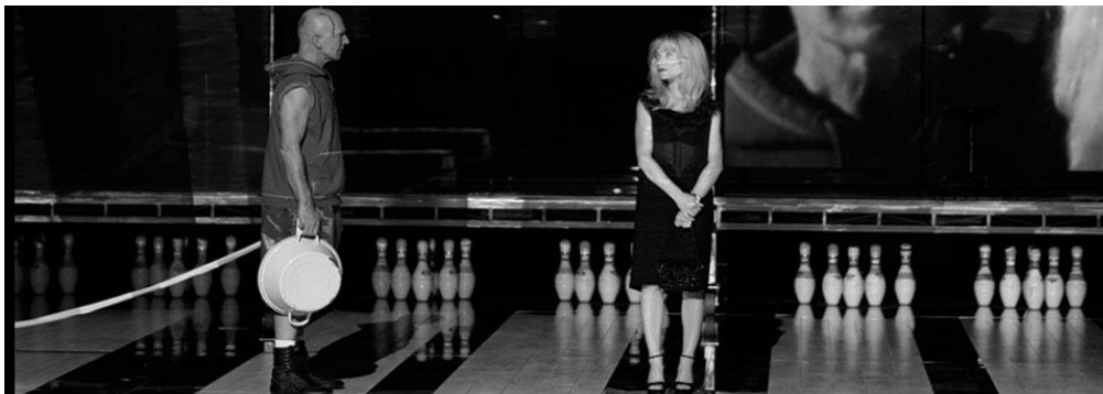
GRAPH 1. Adelaide festival (adapted from)

because of their constant reoccurrence. With the look of things, it is advisable that every community and destination should engage itself in one or more hallmark events so as to acquire a high level of media recognition and exposure and also positive imagery for competitive advantages. It should be noted that, despite the fact that a one-time event can boost a destination in terms of exposure and positive image, it cannot easily be a ‘hallmark’ for that destination (Getz 1997, 5-6.) A typical example of a Hallmark event is the popular Adelaide festival which has created a strong tradition of innovation and inspirational performances, drawing on selections of diverse art forms from across Australia and around the world since its launch in 1960.