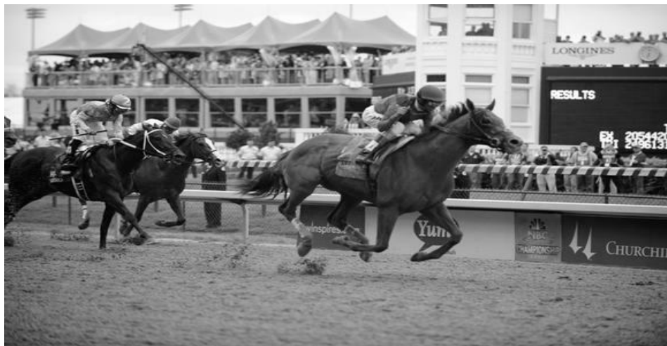
GRAPH 2. Kentucky Derby (adapted from http://www.kentuckyderby.com/news/photos )

Another researcher in the field of events and tourism defines it as events which are expressively targeted at the international tourism market and may be suitably described as 'mega' by virtue of their size in terms of attendance, target market, level of public financial involvement, political effects, extent of television coverage, construction of facilities and impact on economic and social fabric of the host community (Hall 1992, 5). A major characteristic of this classification of an event is that they are mainly annual events and they attract tourists from all around the world. And because of their international nature, mega events are usually reverberated in the global media. Examples include the FIFA World Cup, International trade fairs and exhibition, the Olympic Games etc. The graph illustrated below is a typical example of a mega event as of 2001; the 127th running attracted a crowd of 154,210, the second largest attendance in Derby history. Overall Derby Day wagering (all sources) rose to a record $107,598,904.