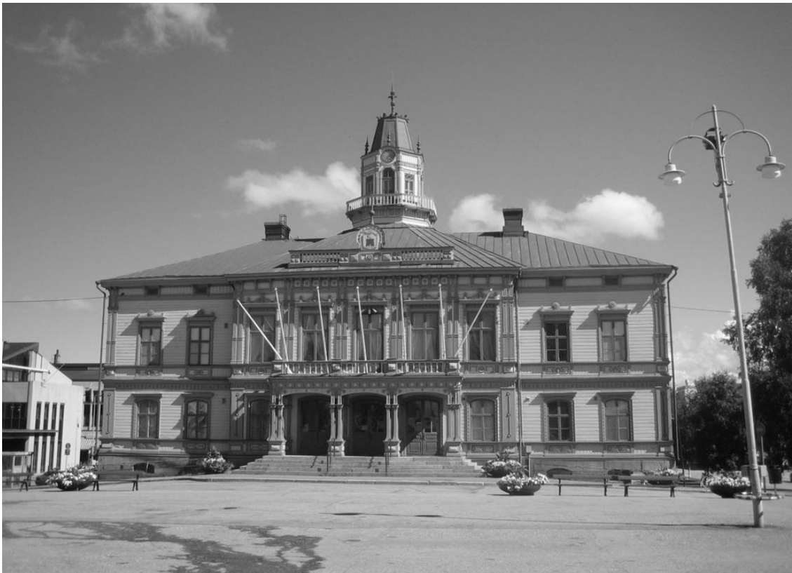
GRAPH 5. Pietarsaari City Hall

Pietarsaari as it is called in Finnish, and Jakobstad in Swedish, was founded on the 19 th of June 1652 by Count Jacob de la Gardie after being granted the right to found a town in the parish of Pedersöre by Queen Christina. Unfortunately, Count Jacob died shortly after he got the grant, but his wife, Countess Ebba Brahe, renewed the rights on 27th October 1652. She also ordered a plan for the town, built a council house and a customs house and decided that the name of the town would be Jakobstad. The Finnish-speakers however retained the old name of the parish and therefore the name of the town in Finnish still remains Pietarsaari (from Pedersöre). The town's coat of arms is based on the de la Gardie coat of arms. (welcome to Jakobstad/Pietarsaari)