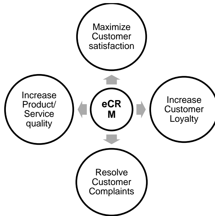
Figure 3. Key Components of eCRM. Fjermestad and Romano (2006, p. 44)

Based on these key components it can be said that eCRM as CRM are processes of acquiring, maintaining and developing valuable customers, although it requires a special focus on service features that create customer loyalty and introduce a real value for them.